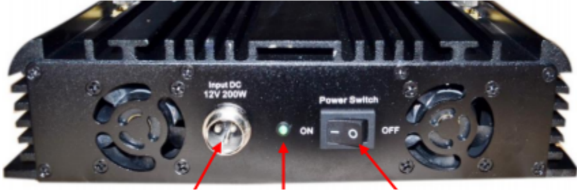
DC 12V Power Jack Pilot Lamp Power Switch

After connecting all the necessary components and securing the cables, press the switch on the left side to the "ON" position. The jammer will start operating, indicated by a green power pilot lamp.